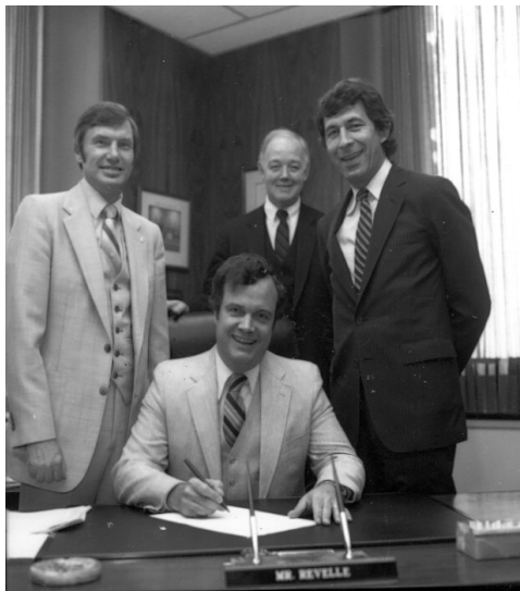
King County Executive Randy Revelle and Seattle mayor Charles Royer jointly proclaim National Public Works Week while administrators look on, 1982.

Kingdome stadium tenants (professional sports teams); interactions with cities and officials in King County, including Seattle mayor Charles Royer; and Randy Revelle's interest in mental health policy and programs. 95 cu. ft.