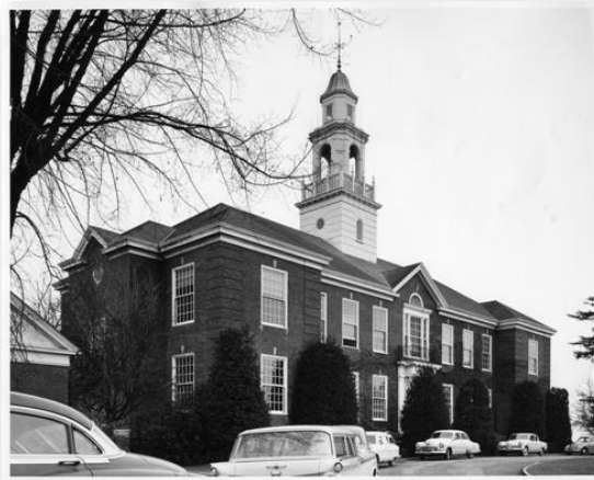
Bliss Hall, circa 1954.

This summer and over the course of the upcoming school year, Lakeside School will be renovating one of its oldest buildings, Bliss Hall, built in 1930. Those of us who have offices in the building will need to move everything out for a period of nine or ten (or eleven or twelve) months. Unfortunately, that includes our archives. Although the archives occupies a relatively small space--roughly 400 square feet--this presents me with a fairly serious challenge for the current school year.