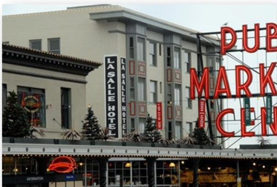
Lasalle Hotel: Pike Place Market PDA. 1426 Western Avenue. Seattle Municipal Archives Item 163235.

Digital photographs recently uploaded to the online database include images from the Office of Housing (Records series 3500-01) including: Charleston Apartments, LaSalle Hotel, Colman School, Cooper School, the Compass Center, Croft Place Townhomes and West Seattle Community Center.