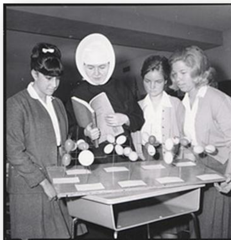
Science class at Providence High School, Burbank, California, 1960s.

Providence Archives is now on Flickr , a popular web site for online photo sharing. Visit our "photostream" at http://www.flickr.com/photos/provarchives/